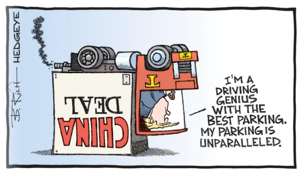
: Donald the genius driver of the China Trade Deal 8 Oct 2019