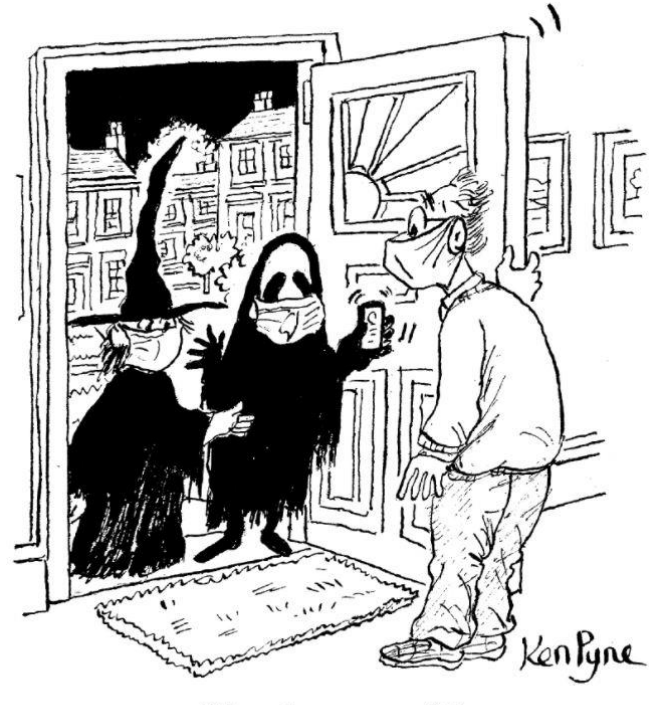
"Track or trace?"