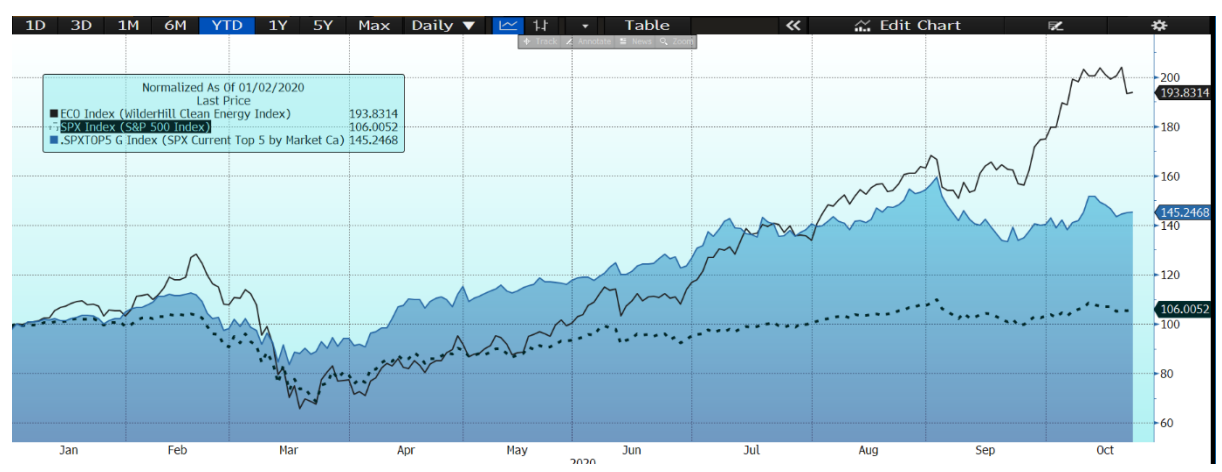
US WilderHill Clean Energy Index (solid black line) versus US S&P500 (dotted) and the US Tech Big Five (solid blue)

Over the course of this year – and well before – we have grown used to the incredible outperformance of the US technology sector. Such is the size and strength of Silicon Valley that at times US mega-cap tech stocks have accounted for most price moves in the overall stock market. But tech has been far from the only 'winner' out of the pandemic, even if it has been the most noticeable. In fact, since global stock markets sunk to their depths in March, green stocks – those that stand to benefit from environmental regulation and the shift towards cleaner energy – have rivalled the performance of the five biggest tech stocks (Facebook, Apple, Amazon, Microsoft and Google). The chart below shows the price action of the US WilderHill Clean Energy Index – a modified equal dollar-weighted index of publicly-traded clean energy companies – against the performance of the S&P 500. As you can see, green stocks suffered heavier losses than the wider market in the early part of the year, but have since recovered all of those losses. In October, with expectations feeding into the market that candidate Joe Biden may win November's presidential election, it has clearly outperformed the S&P's mega-caps.