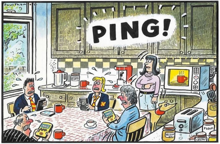
'False alarm, everyone - that WAS the microwave'